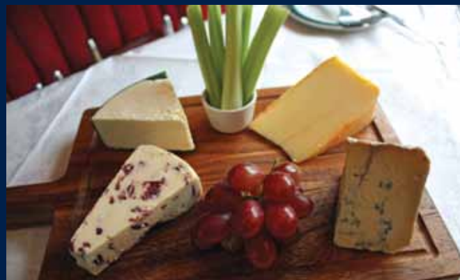
Yorkshire cheese board

Freshly brewed Yorkshire tea served with Yorkshire fruit loaf.