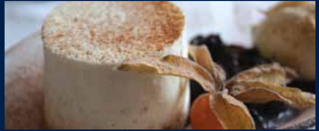
White chocolate cheesecake - evening Pullman menu

Due to the popularity of our Pullman service, advance booking is essential. Visit www.nymr.co.uk , call 01751 472508 or email info@nymr.co.uk