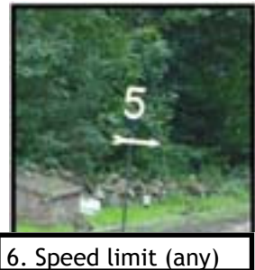
6. Speed limit (any)