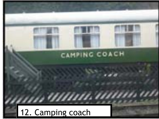
12. Camping coach