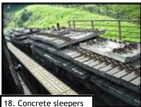
18. Concrete sleepers

How did you do? It's very difficult to spot everything. Ask your teacher for more information about the pictures.