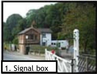
1. Signal box

What can you spot on your train journey? How many of these things can you find? Some are harder to spot than others!