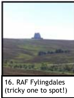
16. RAF Fylingdales (tricky one to spot!)