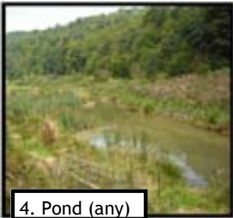
4. Pond (any)