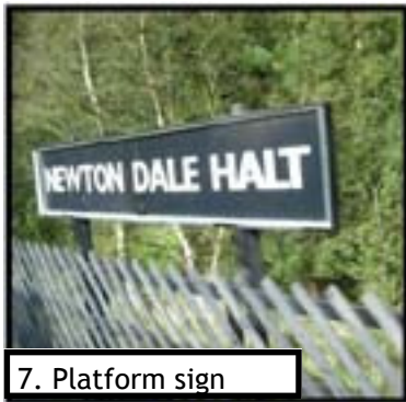
7. Platform sign