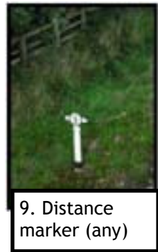
9. Distance marker (any)