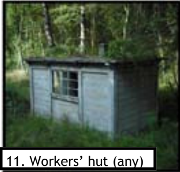
11. Workers' hut (any)