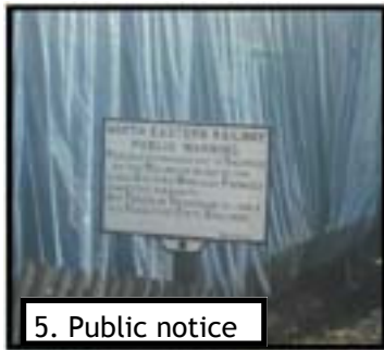
5. Public notice