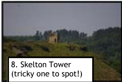
8. Skelton Tower (tricky one to spot!)