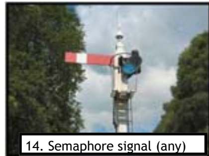
14. Semaphore signal (any)