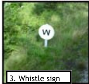
3. Whistle sign