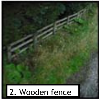
2. Wooden fence