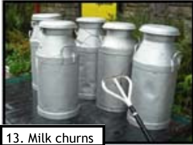
13. Milk churns